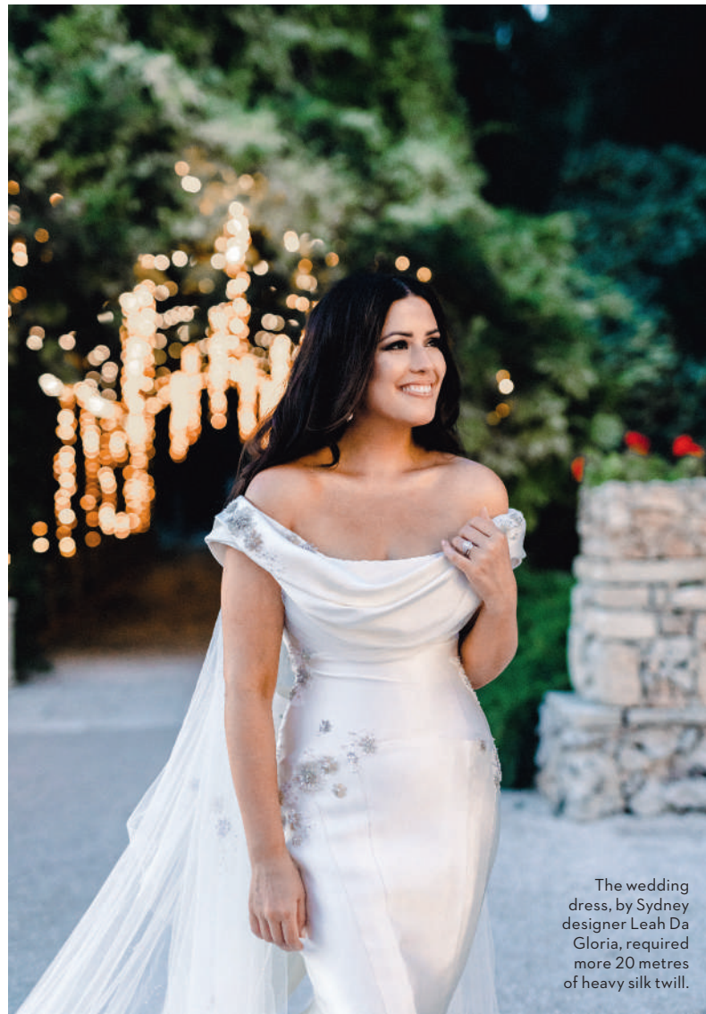
The wedding dress, by Sydney designer Leah Da Gloria, required more 20 metres of heavy silk twill.