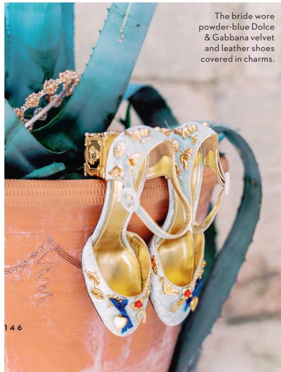
The bride wore powder-blue Dolce & Gabbana velvet and leather shoes covered in charms.