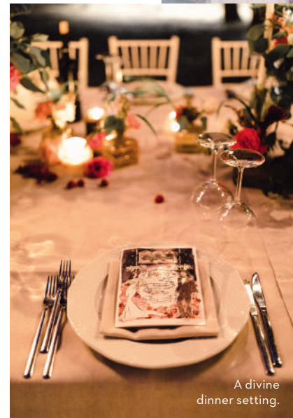
A divine dinner setting.