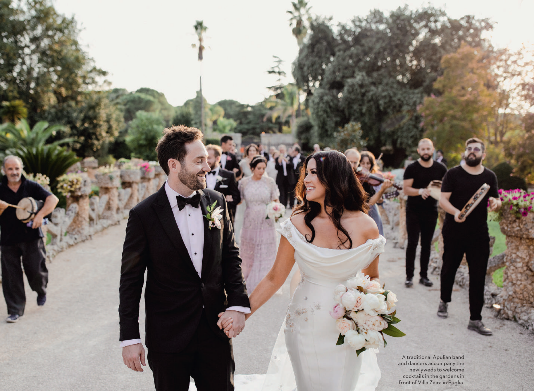
A traditional Apulian band and dancers accompany the newlyweds to welcome cocktails in the gardens in front of Villa Zaira in Puglia.