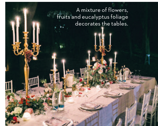
A mixture of flowers, fruits and eucalyptus foliage decorates the tables.