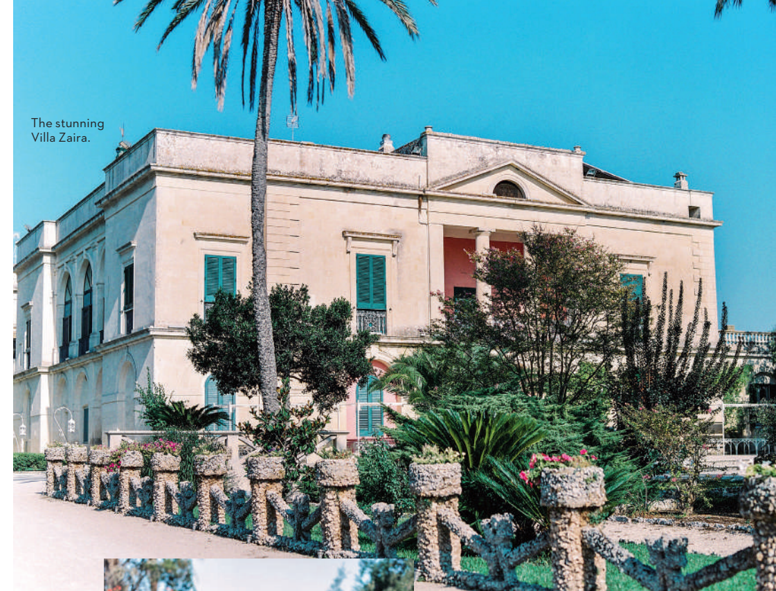
The stunning Villa Zaira.