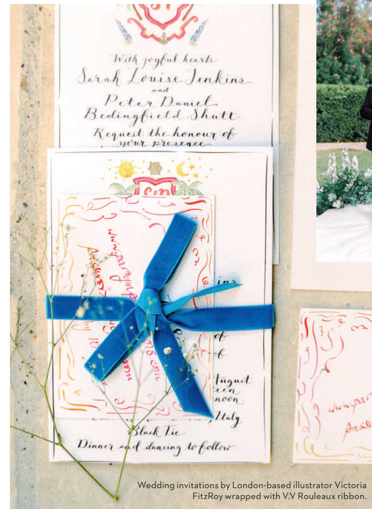
Wedding invitations by London-based illustrator Victoria FitzRoy wrapped with V.V Rouleaux ribbon.