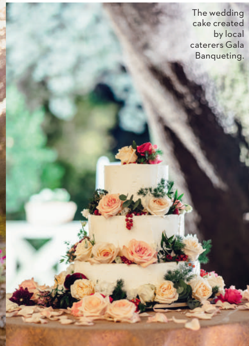
The wedding cake created by local caterers Gala Banqueting.