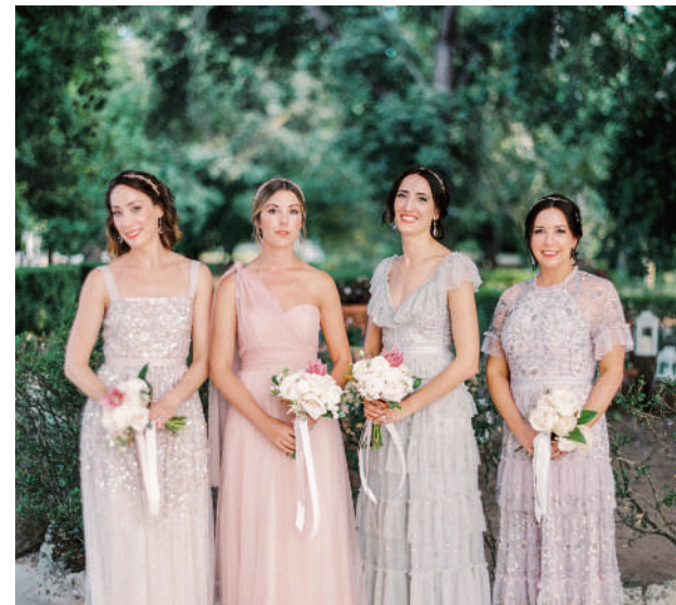
The bridesmaids were on different continents in the lead-up to the wedding and wore individual gowns: the bride matched their earrings and headbands to keep it cohesive.