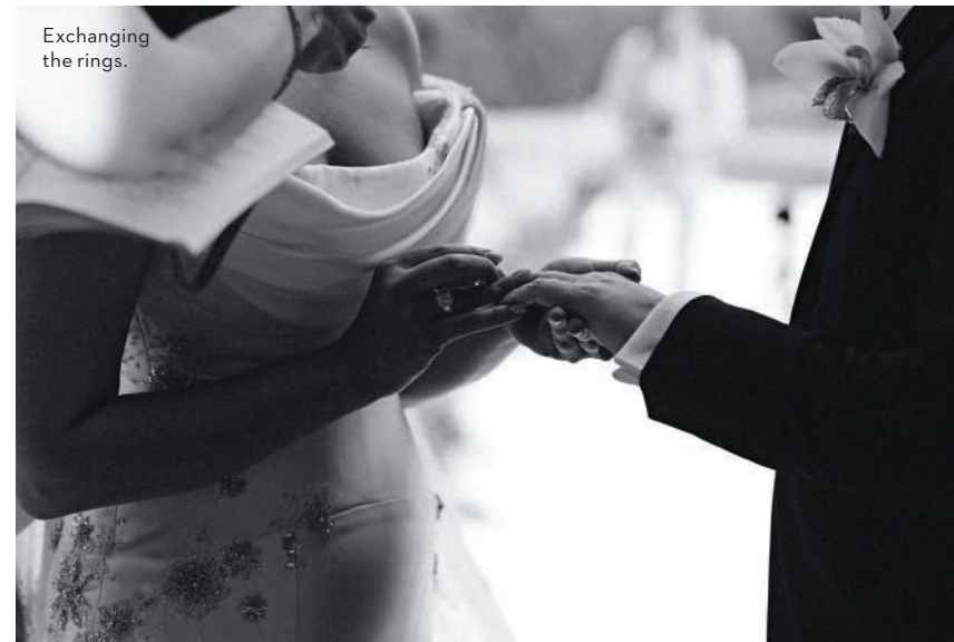
Exchanging the rings.